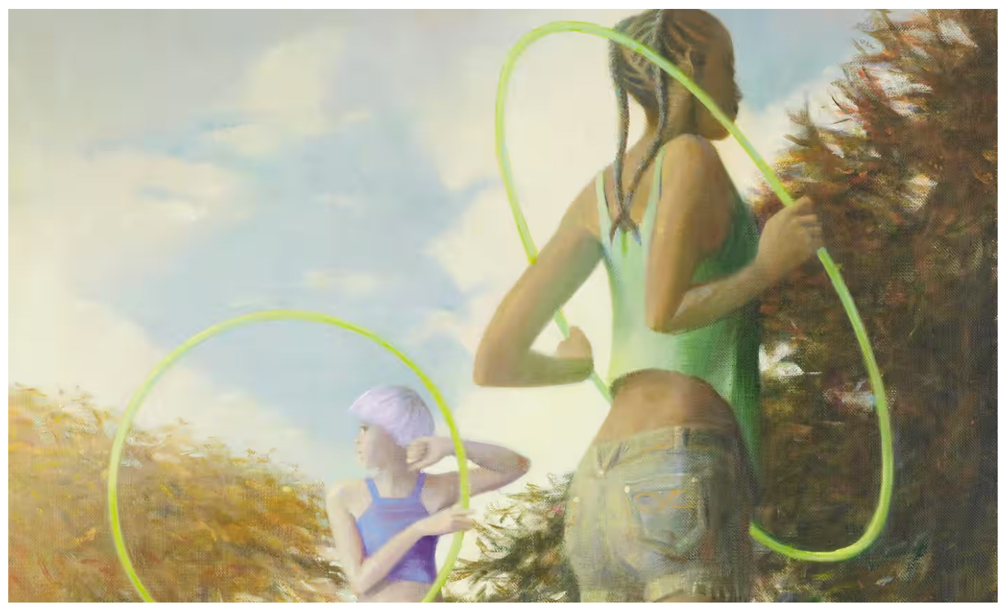
Anatomy of an artwork