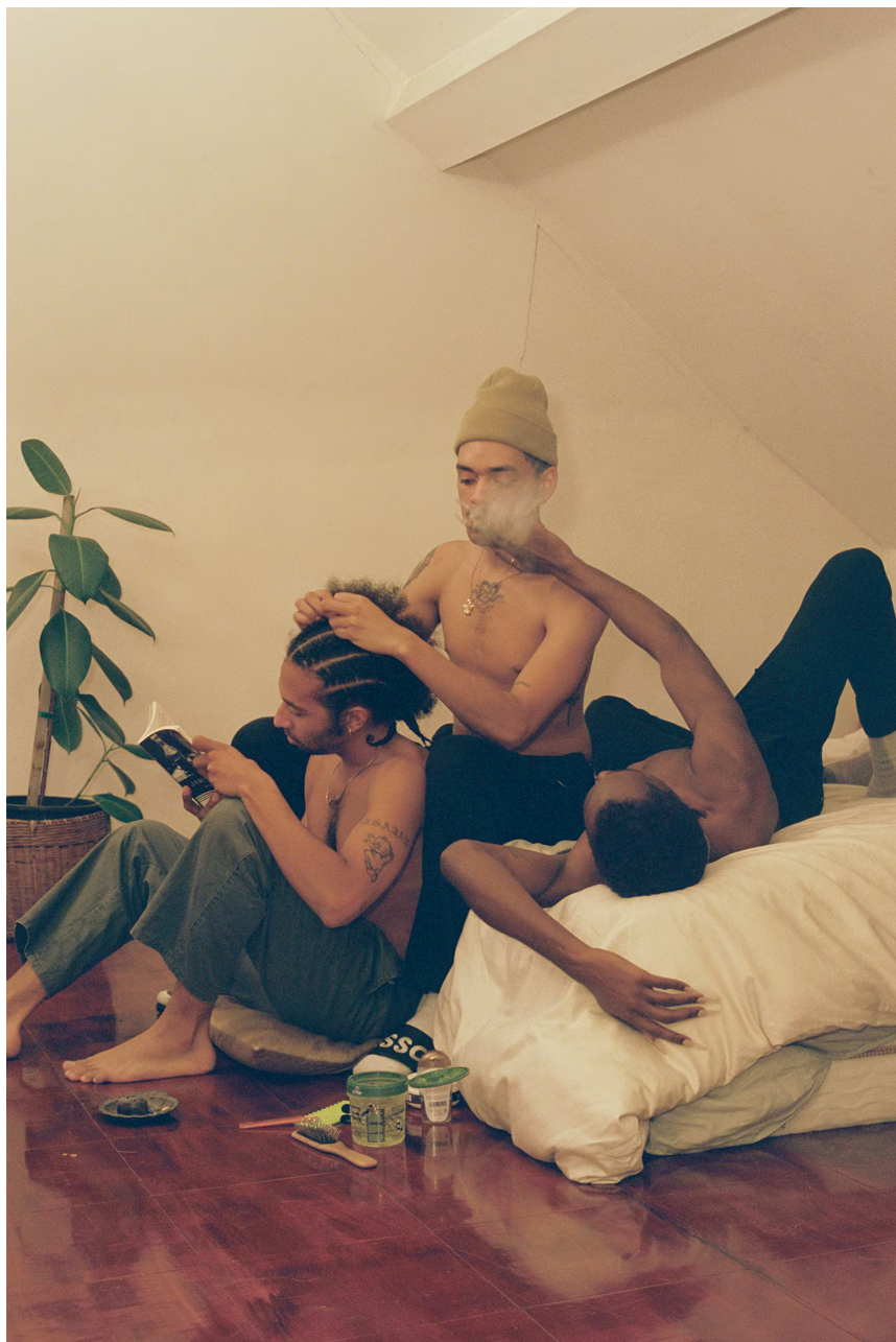
Clifford Prince King, 'Safe Space,' 2020.

T he London-based curator Gemma Rolls-Bentley has selected artworks for the Leslie-Lohman Museum of Art in New York City, the Tom of Finland Art & Culture Festival in England, and curated the Brighton Beacon Collection, the largest permanent display of queer art in the U.K. But Rolls-Bentley's latest project is likely her most expansive—and personal one—yet. Her new book, Queer Art: From Canvas to Club and the Spaces Between , features over 230 pages of photographs, paintings, digital art, and installations that exemplify and encapsulate queer life, through the eyes of queer folks. “My book investigates the role of queer art today and acknowledges the history-defining impact of our communities in the cultural landscape,” Rolls-