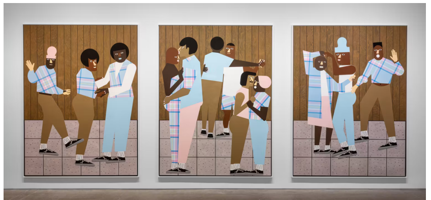
© Nina Chanel Abney. Photo courtesy of Pace Prints

Nina Chanel Abney, Day Party, Gay Party , 2022.